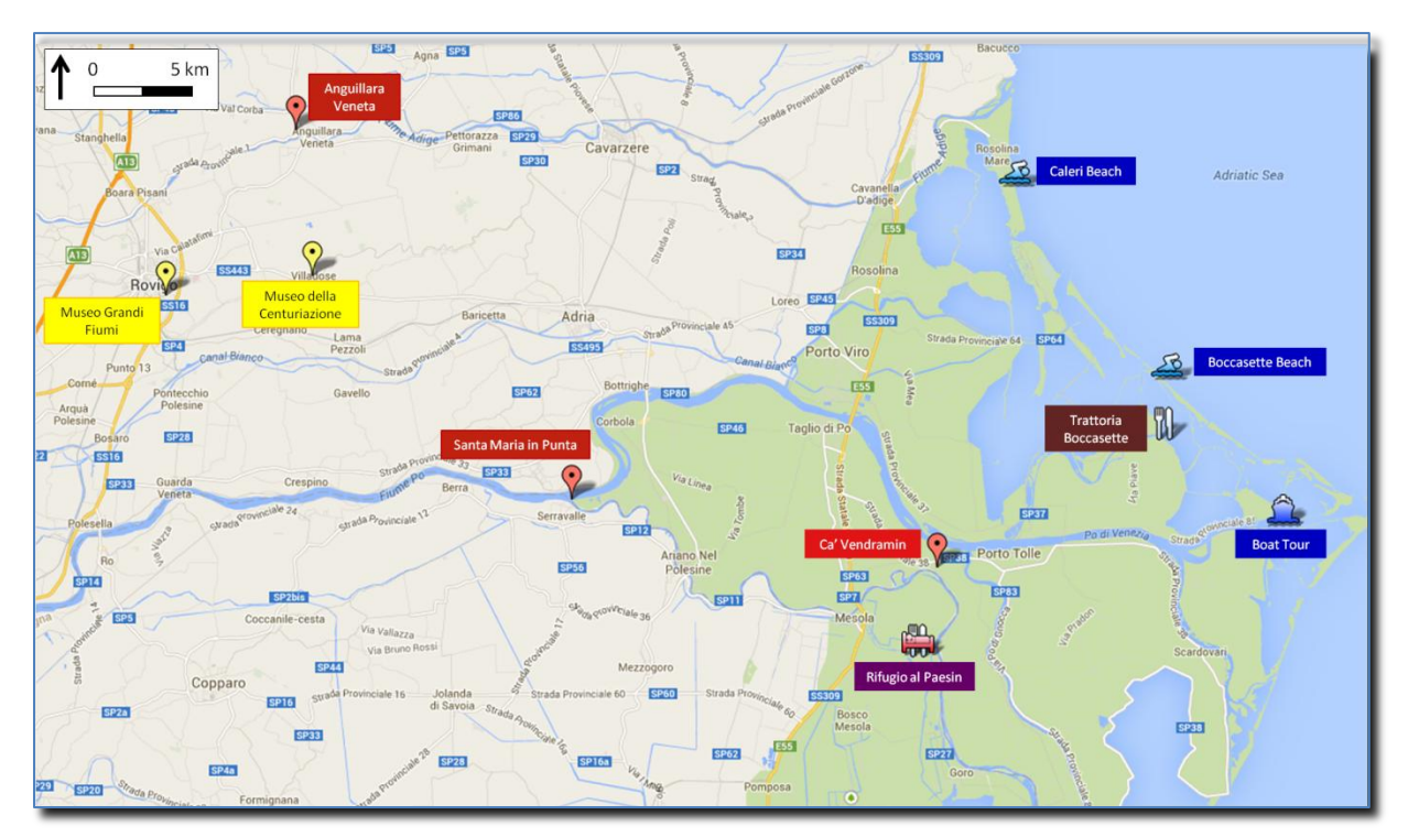
Figure 1 Map of the Polesine Delta.

Map. Below you will find three maps: 1) an overview map of the Polesine Delta with the key locations on the Geography of Water Seminar, 2) a map of central Padova and 3) the Rifugio in the Po Delta. The important seminar locations during the visit to each region are shown.