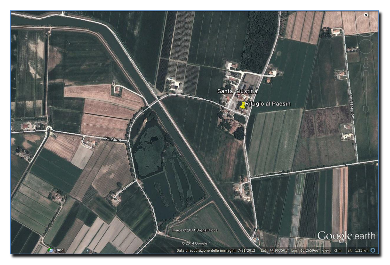
Figure 3 Map showing the Rifugio location in the Po Delta region.

We look forward to seeing you soon in Padova later this month!