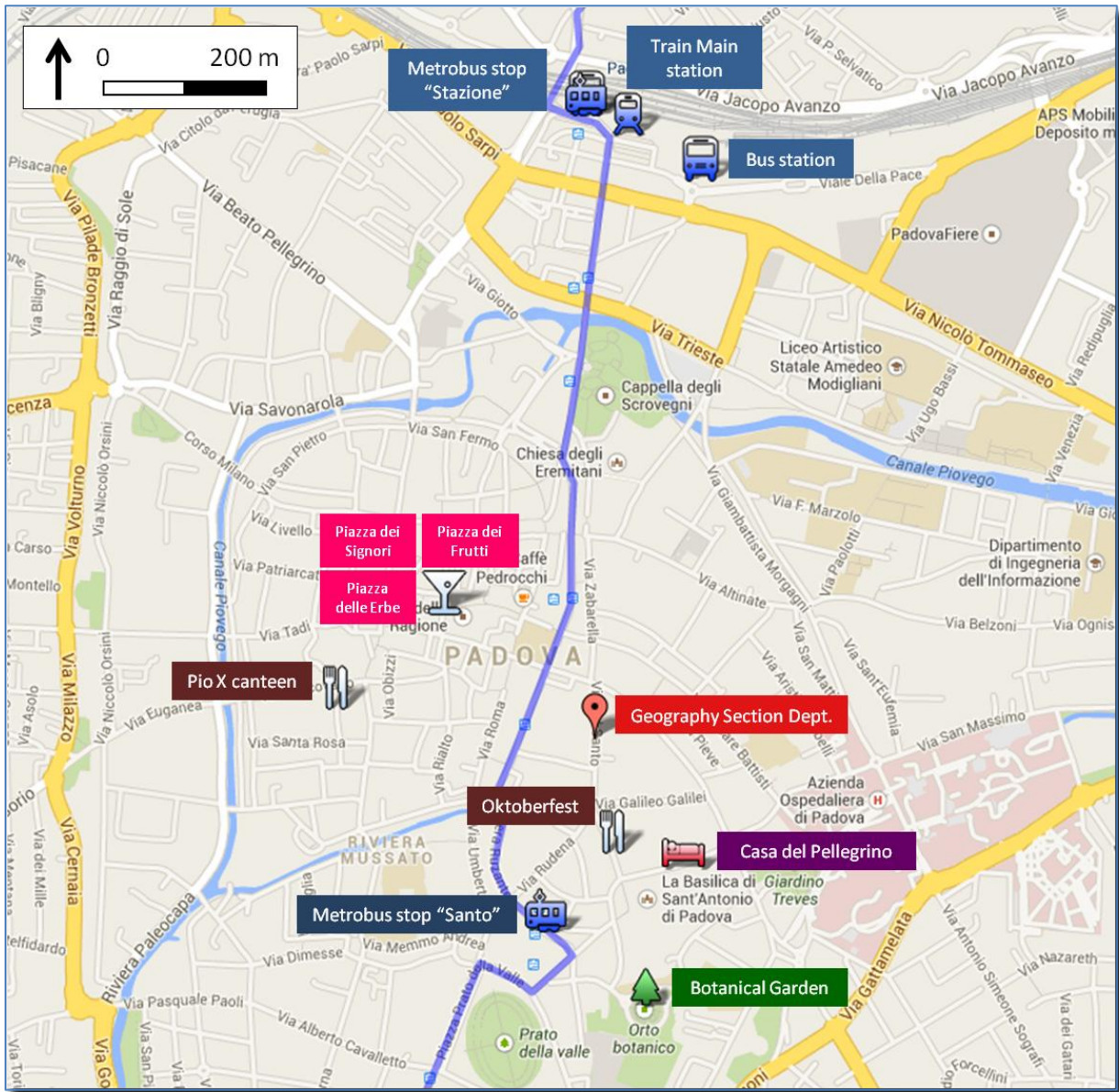
Figure 2 Map of central Padova with important locations during the Seminar.