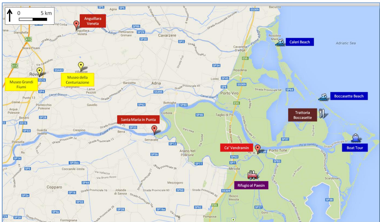
Figure 1 Map of the Polesine Delta.

Map. Below you will find three maps: 1) an overview map of the Polesine Delta with the key locations on the Geography of Water Seminar, 2) a map of central Padova and 3) the Rifugio in the Po Delta. The important seminar locations during the visit to each region are shown.